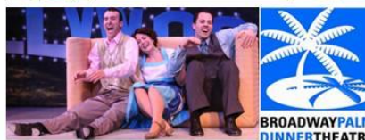
BROADWAY PALM DINNER THEATRE