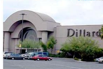
SUPERSTITION SPRINGS CENTER