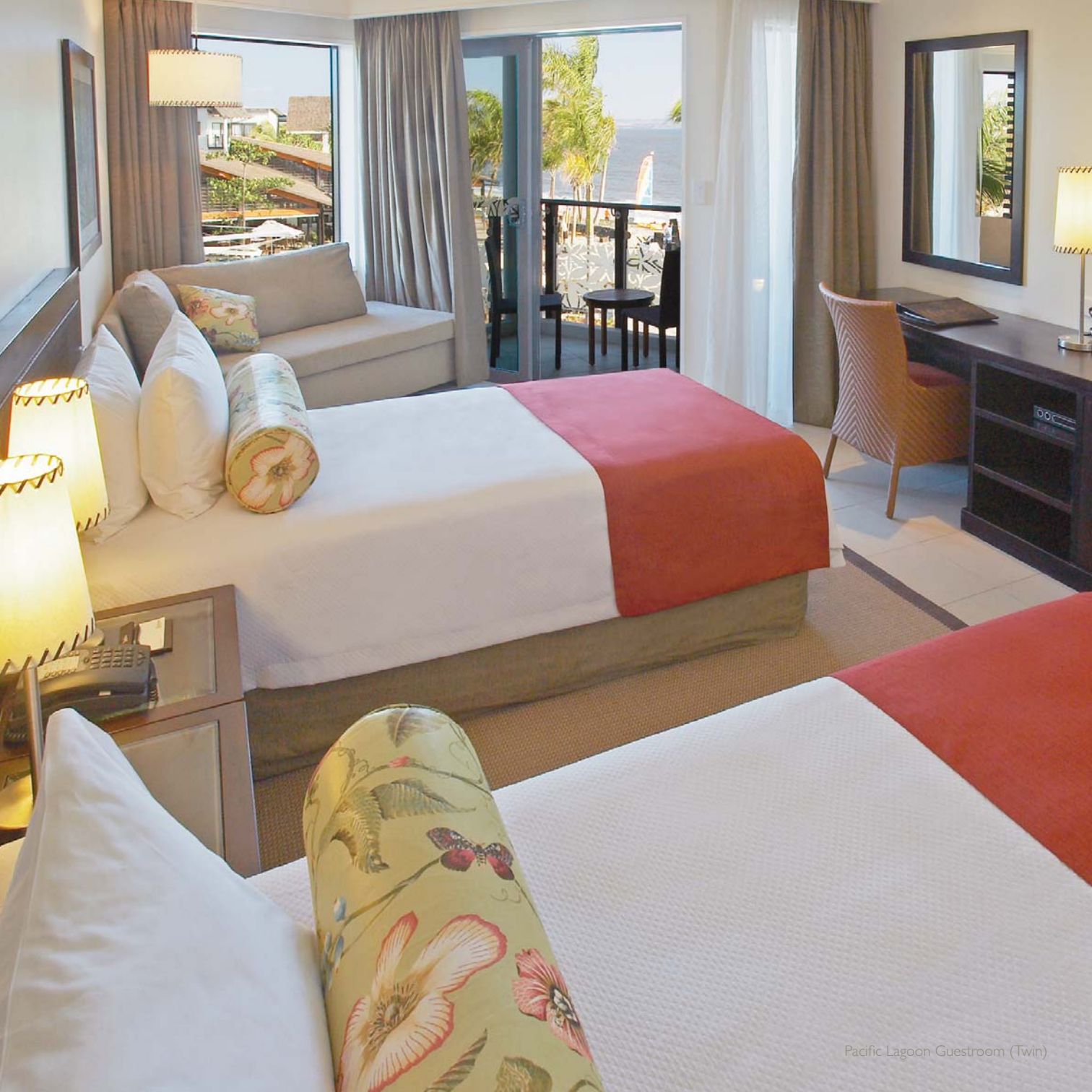
Pacific Lagoon Guestroom (Twin)