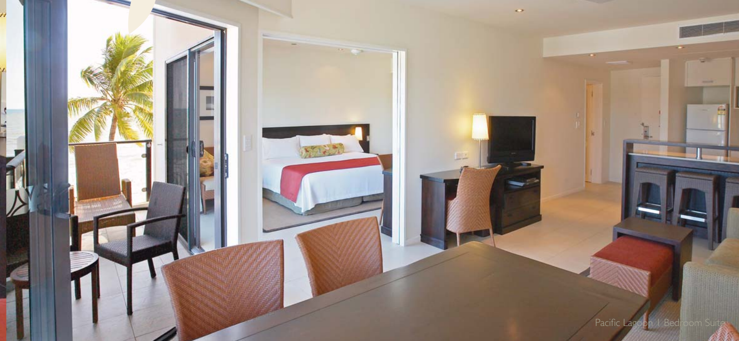
Pacific Lagoon 1 Bedroom Suite