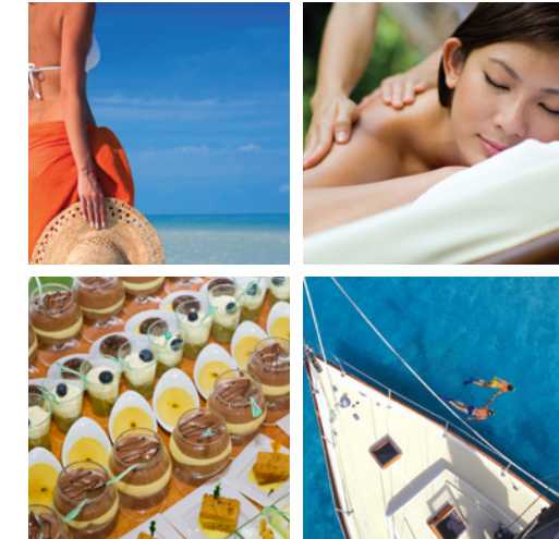
Spa, Romance, Gourmet & Scuba Diving

Reservations: 800.333.3333 Radisson.com/StMartinSpa Radisson.com/StMartinScuba Radisson.com/StMartinRomance Radisson.com/StMartinDine